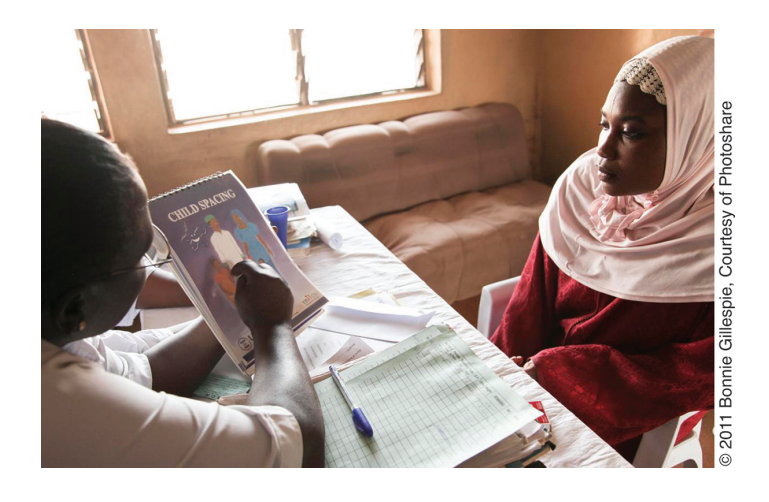
A provider counsels a young woman on birth spacing at a primary health care center in Kagoro, Nigeria.

infants. And when pregnancies are planned, research shows that mothers can breastfeed for longer periods of time and breastfeeding practices improve, leading to improved nutrition.<sup>13,24,25,26</sup>